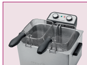
Incl. 2 small baskets for various types of food