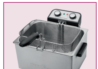
Incl. large frying basket

Color: Stainless steel Article-No.: 501 038 Article EAN-Code: 4 006 160 011 203 Exportpack EAN-Code: 4 006 160 036 237 PU: 2 pcs. Pallet: 20"/40"/HQ Container: 630 / 1290 / 1500